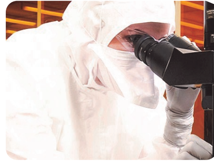
*Contact MDS for Innovative Disposable Apparel*