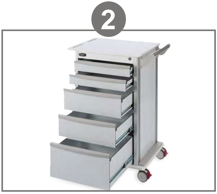
All drawers are locked and unlocked with one key. Varied sizes in drawers for most effective storage options.