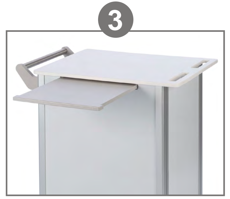
Convenient pull-out supplementary surface to expand work area.