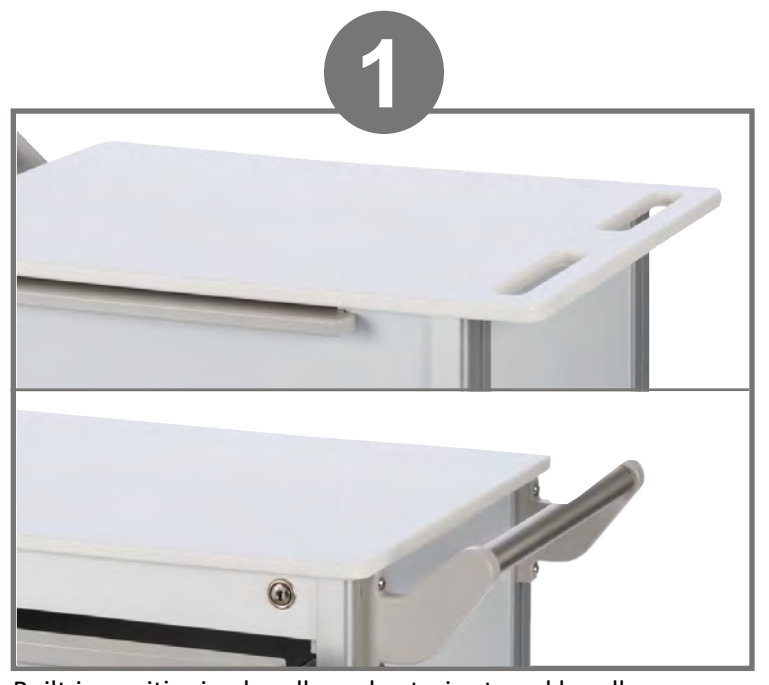
Built-in positioning handle and exterior travel handle.