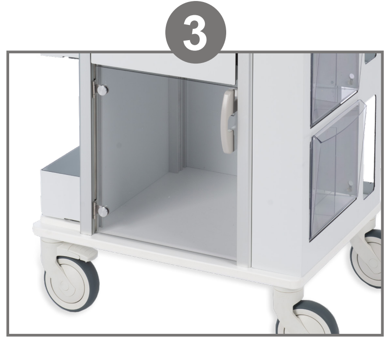
Large, locking, doored area provides additional storage for larger items.