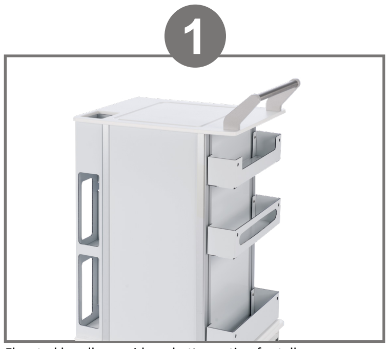
Elevated handle provides a better option for taller users.