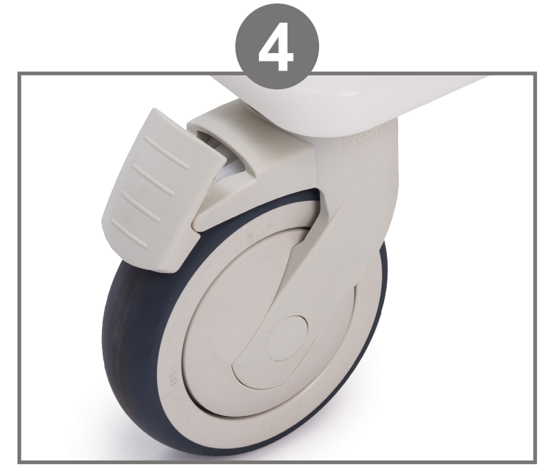
Two easy toe lock and unlock casters to immobilize cart for use.