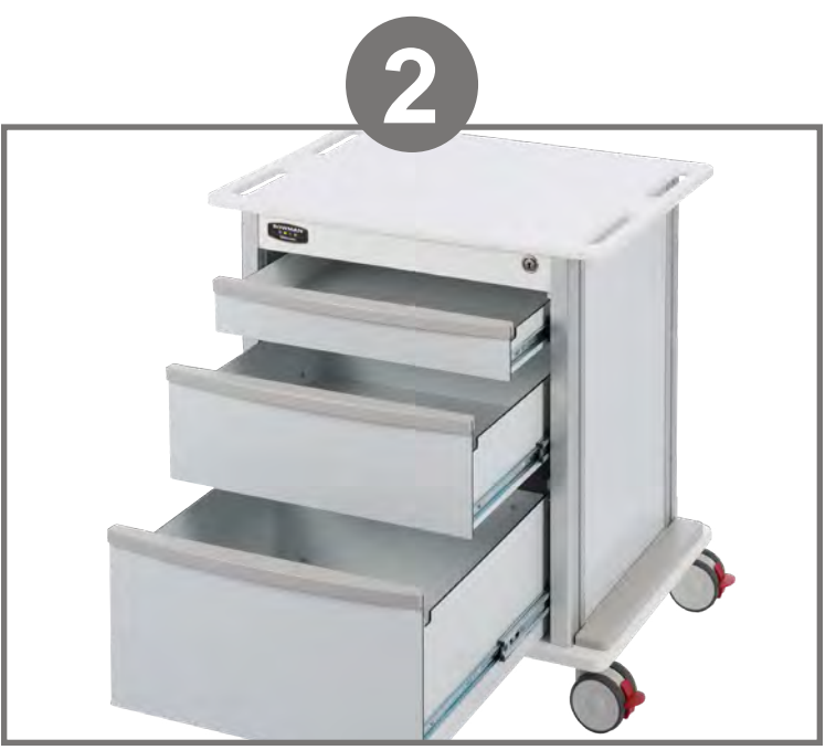
All drawers are locked and unlocked with one key. Varied depths of drawers for most effective storage options.

Built-in positioning handles on both sides.