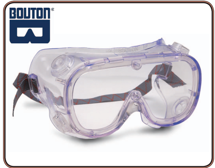
Polycarbonate lenses block 99.9% of the sun's ultraviolet rays. This ultraviolet protection has already been incorporated within the lens material when the lenses are being produced.

Color: Clear Blue Transparent to prevent yellowing