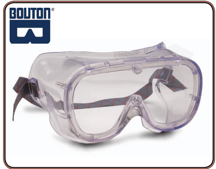
Polycarbonate lenses block 99.9% of the sun's ultraviolet rays. This ultraviolet protection has already been incorporated within the lens material when the lenses are being produced.

Strap: Elastic Braid, threaded through frame, adjustment through lugs in goggle body