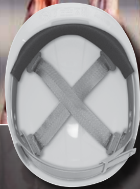
COMFORT PLUS HARNESS WITH SWEAT BAND