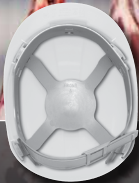
STANDARD POLY HARNESS

A light and comfortable cap that's designed ONLY for accidental bumping or scraping of the head.