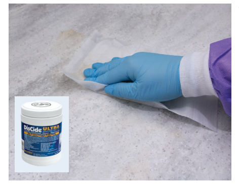
Step 2: Wipe down the surface with a DisCide Ultra towelette to remove debris and bioburden.

Step 1: Spray hard non-porous surface with DisCide Ultra Spray to help loosen bioburden.