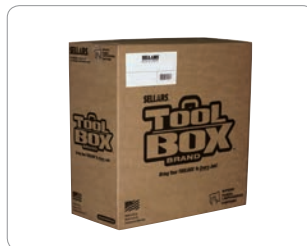
Z400 GreenX Series Interfold Outer Case