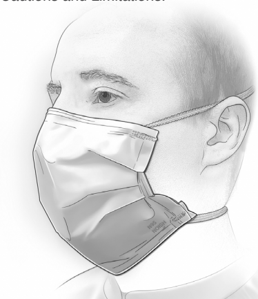
Made in USA from Domestic Materials